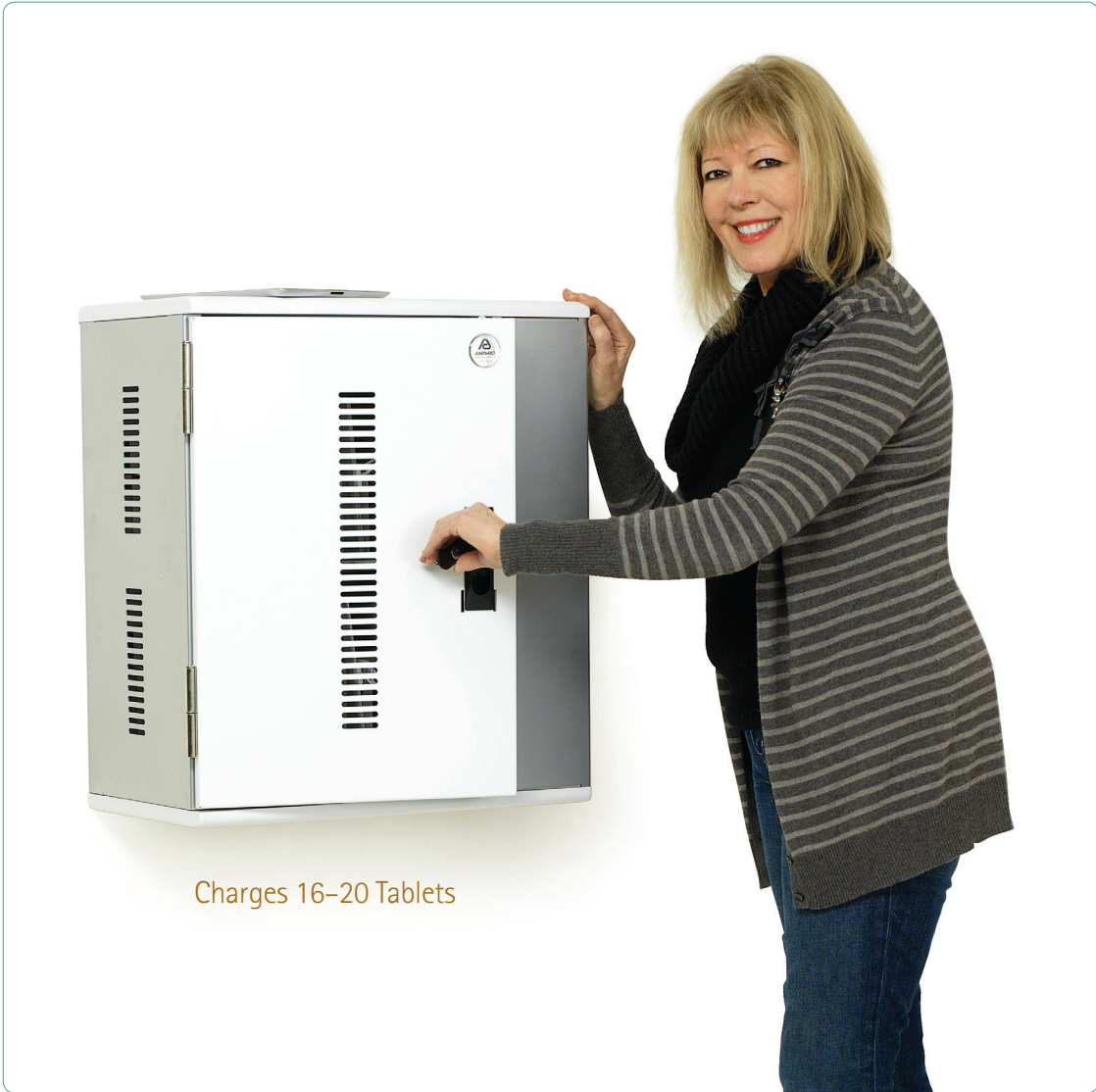
Charges 16-20 Tablets