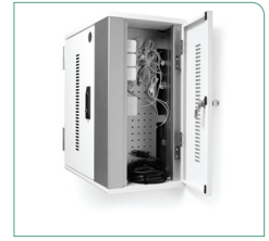
Separate locking IT area