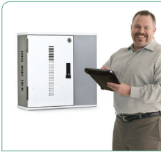
Kits included for mounting onto walls or countertops