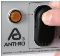
On/off power switch with indicator light