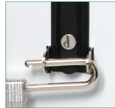
Secure with keys or padlock