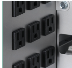
22 power receptacles