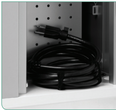
9' long power cord