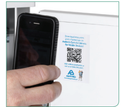
Download product documents to your mobile device